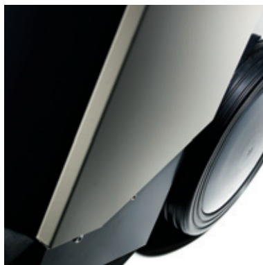
Big rubber wheels ensure safe and easy manoeuvring.