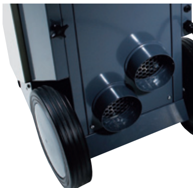
CDT 30 S and CDT 40 S are fitted with a 1 kW heating element and a high pressure fan allowing connection of two flexible hoses Ø100, each up to 5 m long.