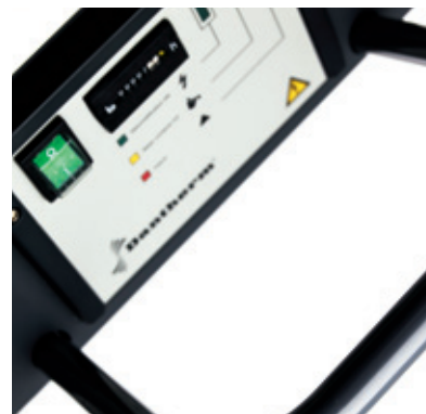
An adjustable handle facilitates transport and a user-friendly display on top of the unit increases operating convenience.

seemingly impassable areas. To make the units as narrow as possible – and thus more manoeuvrable – the major part of the wheels are hidden behind the front of the unit. Still, the rubber wheels are the outermost part of the unit, protecting doors and panels from unnecessary knocks. During transport from one job to the next or in between jobs the CDT units can be stacked, taking up only limited space.