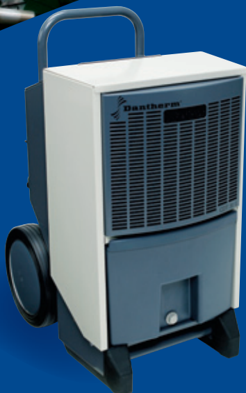
CDT Mobile dehumidification